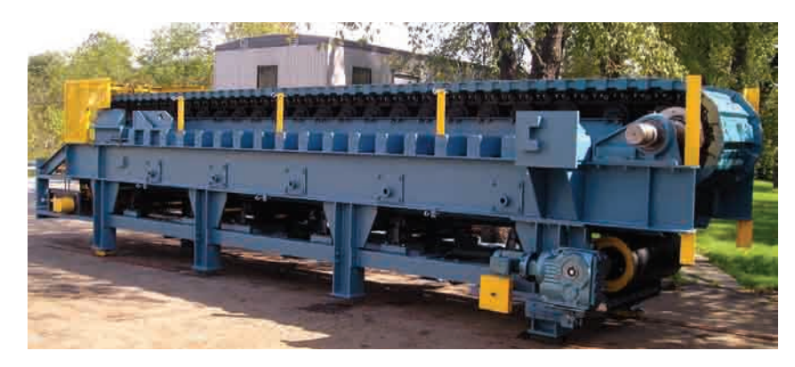
Metso manufactures Apron Feeders of various size, tonnage and drive configurations to meet the specific application and customer requirements.

They are also the preferred type of feeder for many minerals processing applications including gold, copper, and bauxite mines. With more mines and plants running around the clock, operators are opting for new and retrofit equipment that is more reliable and requires less maintenance. This approach has also expanded to other bulk materials handling industries such as coal mines, power plants, rock quarries and cement.