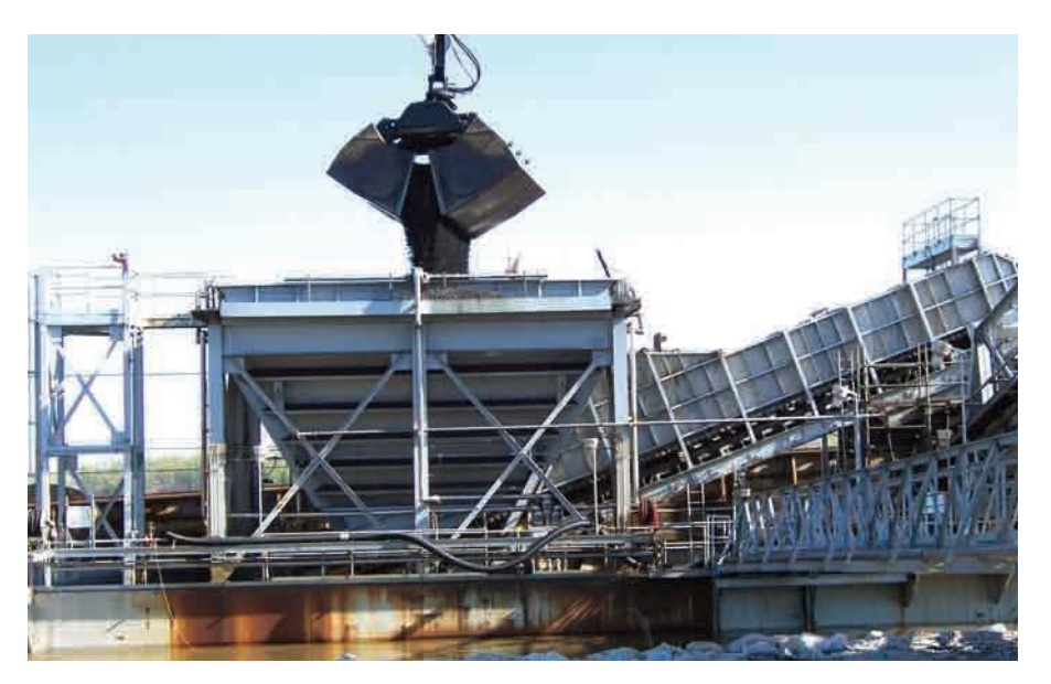
Apron Feeder extracting coal from a hopper on a floating barge to feed a major power plant.