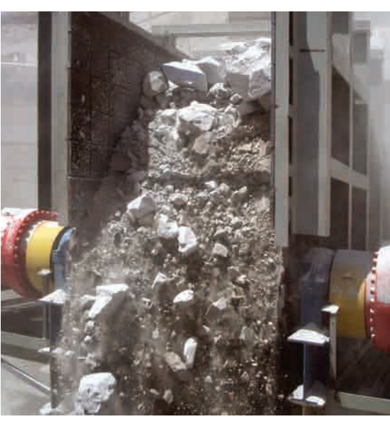
Apron Feeder extracting copper ore from a truck dump hopper to a gyratory crusher.