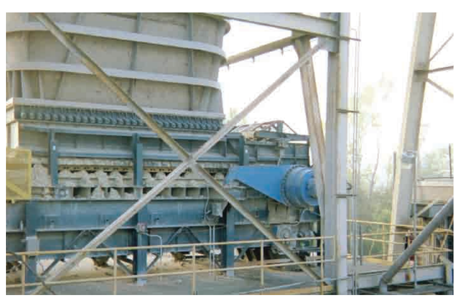
Apron Feeder at a major cement producer extracting clay from a storage bin.

Benefits of the Metso Apron Feeder put it in a class by itself. Metso offers a robust design with an intense commitment to quality and attention to detail. The main benefit to the end user is ruggedness and dependability for heavy-duty operations. The bottom line: reduced downtime and lower overall cost.