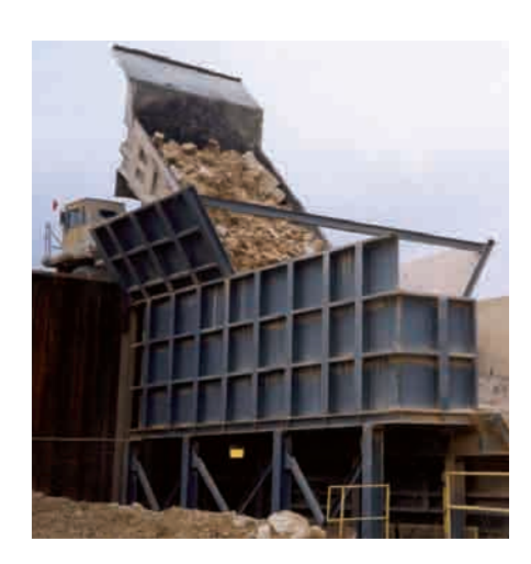
Truck dump hoppers utilize the Metso Apron Feeders to withdraw rock and ore at a controlled rate of speed to feed other equipment such as all types of crushers, vibrating grizzlies, wobbler feeders or conveyors.

"Tractor/dozer chain" style feeders are the preferred design and set the standard for an almost maintenance-free feeder. The Metso Apron Feeder utilizes tractor-type undercarriage chain, rollers and tall wheels that are also used on bulldozers and excavators. All crawler tractor components are 'sealed for life lubricated' and thus do not require regular lubrication. This provides the feeder and end user with many years of reliable, trouble-free operation.