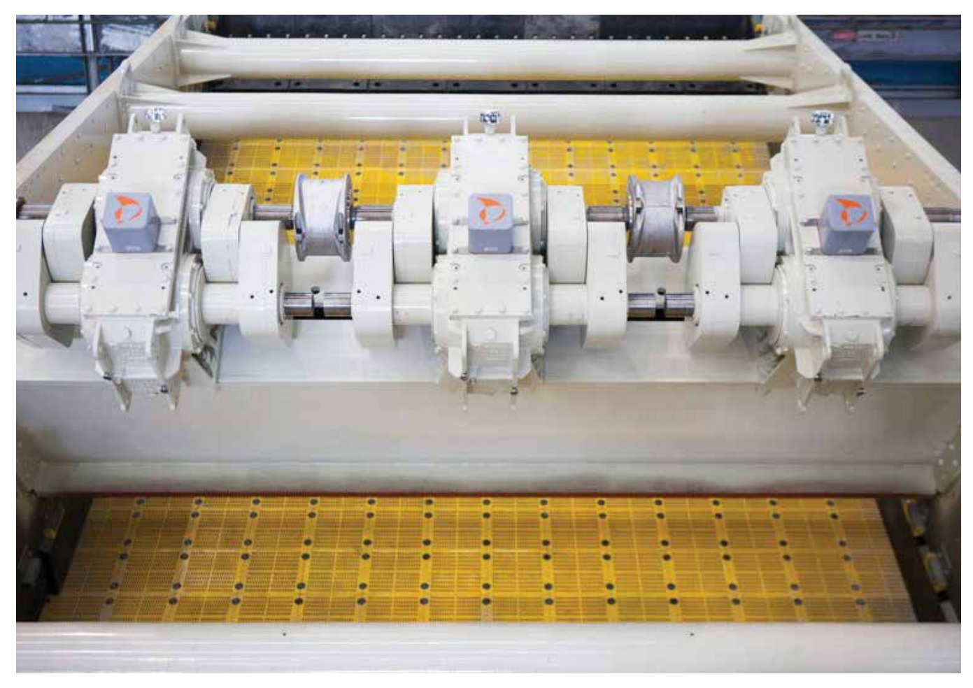
ScreenWatch monitors housing temperature and bearing wear in order to warn you of any potential bearing problems.