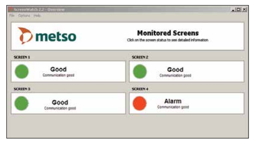
System dashboard makes up to four screen conditions understandable at a glance.

Think of ScreenWatch as a 24/7 guardian for your screen: It's an integral part of preventing structural fatigue and extending its lifespan. More importantly, it optimizes screen performance to help perfect your overall process.