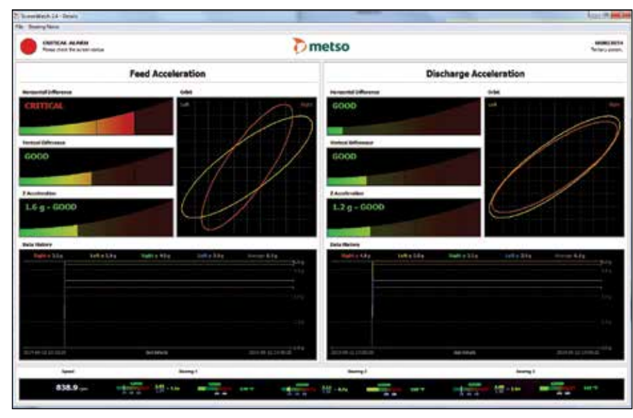
ScreenWatch alerts you when there is a problem related to the screen's health, so minor issues can be addressed before they cause significant maintenance and downtime.

A leap forward from traditional monitoring systems, ScreenWatch is designed for intuitive operation. The integrated system delivers complete diagnostics, alarms, and history at a glance. Modular sensors are wireless, self-powered and easy to use. All components are engineered to IP66 in order to deliver unmatched reliability and lifespan, even in the toughest mining environments.