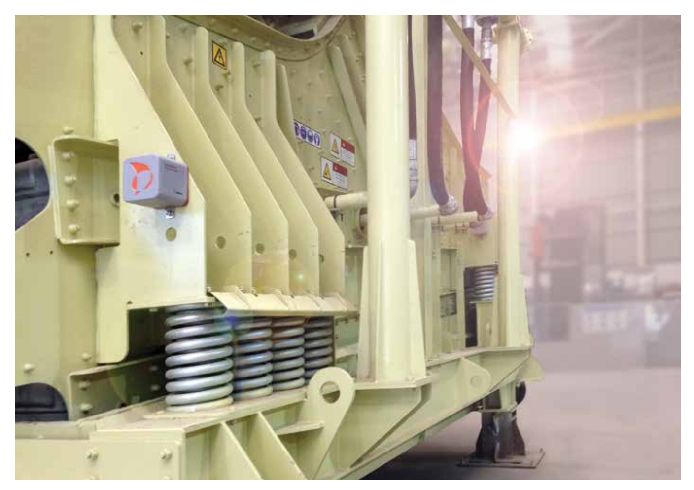
More uptime and screening efficiency help to perfect your overall process.