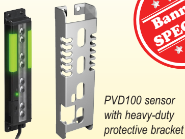
PVD100 sensor with heavy-duty protective bracket

The modified PVD100 came ready to operate right out of the box, requiring no setup or adjustments. It features a wide beam pattern, making alignment easy. The sensor has an unobtrusive low-profile form factor, ideal for integration into existing designs. It is housed in a rugged metal enclosure and offers an optional heavy-duty mounting bracket.