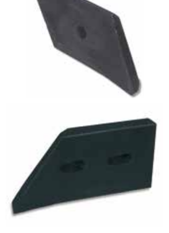
The Trellex paddle range cover most pan mixers brands as, Hilac, Liebherr, Schlosser, Waimer, Ibag, Skako, Eirich, Teka, Comfl ow, Rapid, Haarup, Elba, Fejmert, etc.