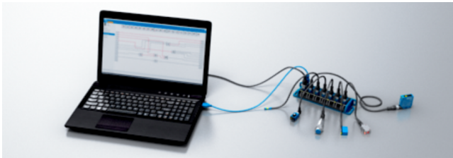
Solve simple application tasks using binary switching signals from sensors or actuators without an additional controller.

System configurations are easy and can be carried out by all kinds of user groups, as no programming knowledge is required.