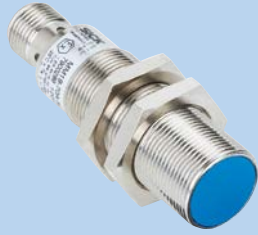
MM12 Namur/MM18 Namur

NAMUR magnetic proximity sensors in a cylindrical housing for explosive areas