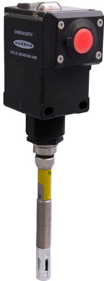
(Shown with the temperature/humidity sensor connected)

Sure Cross® Wireless Q45 Sensors combine the best of Banner's flexible Q45 sensor family with its reliable, field-proven, Sure Cross wireless architecture to solve new classes of applications limited only by the user's imagination. Containing a variety of sensor models, a radio, and internal battery supply, this product line is truly plug and play.