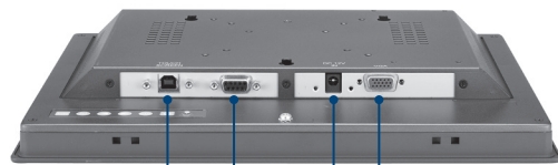
Touch Screen (USB) Touch Screen (RS-232) DC Jack 12V DC (100~240V AC adapter included) VGA Port