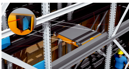
Collision avoidance in shuttle warehouse systems

The Dx35 can be used in a wide variety of applications across all industries. In storage and conveyor systems, for example, it provides reliable empty bay and fill level detection.