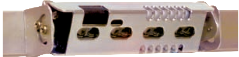
Shown with sensor and bracket model SMBPVD100A

Used for Mounting Parts Verification Array Sensors