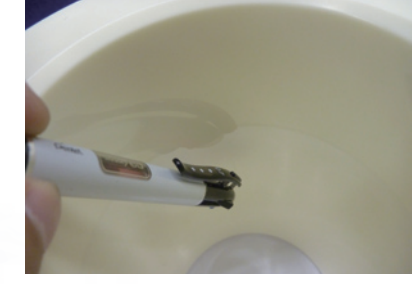
Surface of ceramic liner tube (mirror finished)